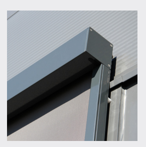
End bracket in aluminium.