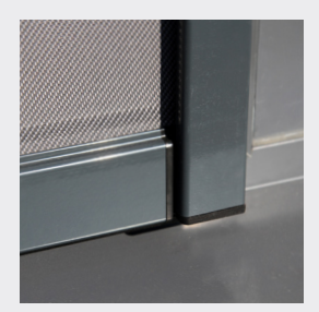
Detail of the bottom profile.