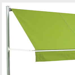
Drop arms with adjustable spring tension for best possible fabric tension.