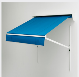
BC56 has heavier arms for longer projection.