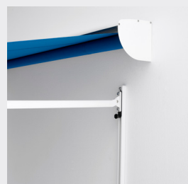
BC56 has adjustable sliding arm brackets.