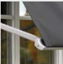
Designed front profile.