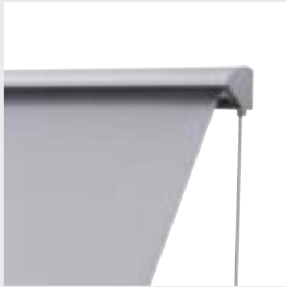
The DA32 awning is equipped with an aluminium cassette to protect against rain and dirt.