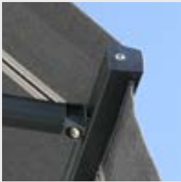
Standard front profile.