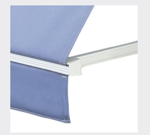
Outside operation with polyester tape.