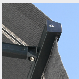
Standard front profile.