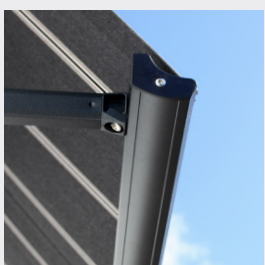
Designed front profile.